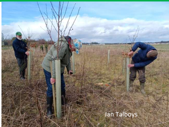
Tree guard removal

SITE MANAGEMENT continues throughout the year, as weather permits. Recently, Volunteers checked the trees planted over the past 5 years. Now becoming established, with many outgrowing their protective tree guards, these guards are being removed and re-used or recycled as necessary. Other activities include mowing of path edges, and selected areas to manage plant growth.